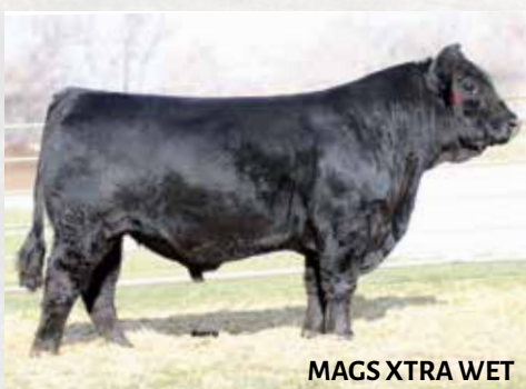
MAGS XTRA WET