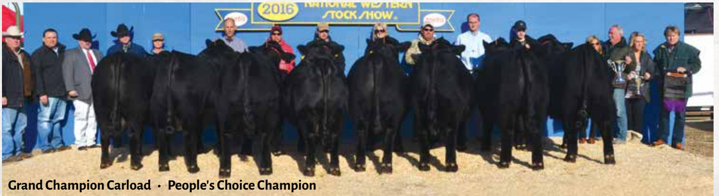
Grand Champion Carload • People's Choice Champion