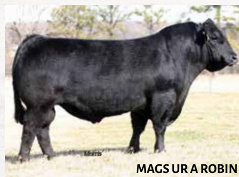
MAGS UR A ROBIN