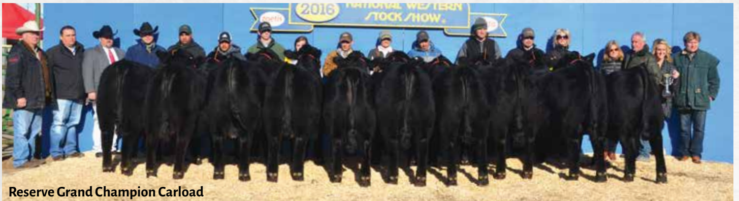
Reserve Grand Champion Carload