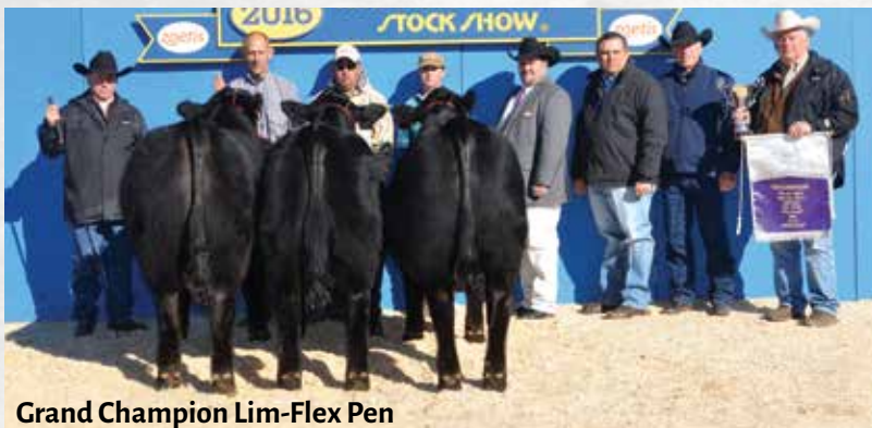
Grand Champion Lim-Flex Pen